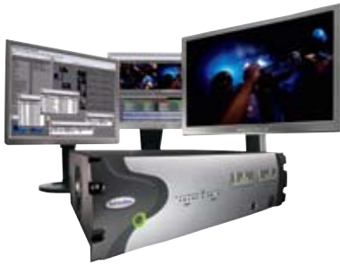
Avid Media Composer